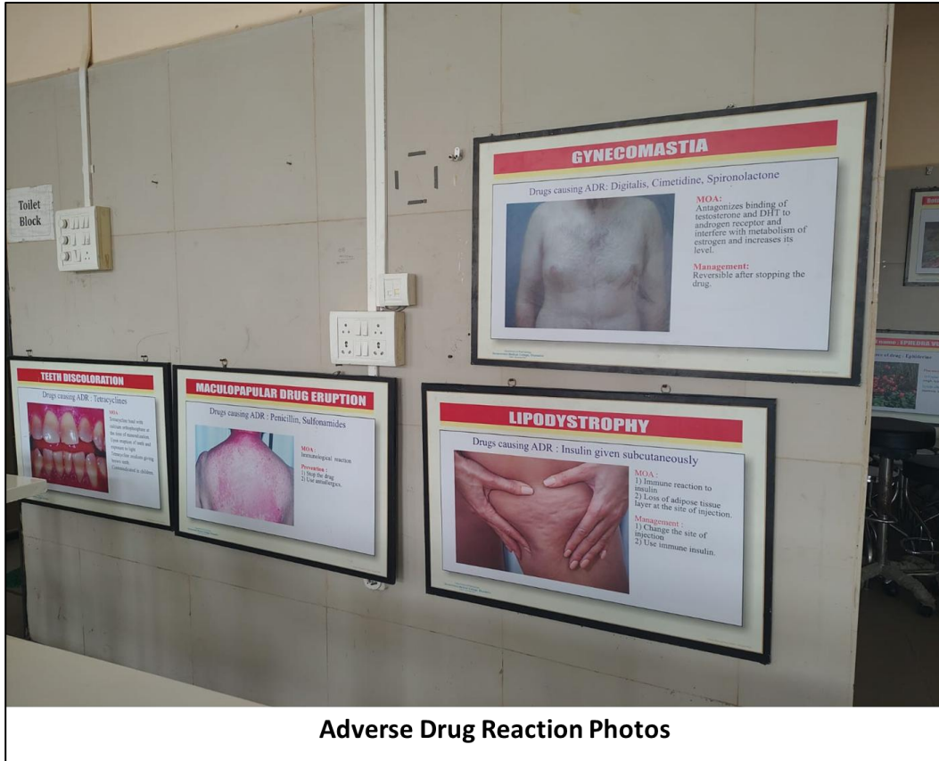
Adverse Drug Reaction Photos