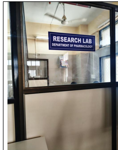
Research lab Department of Pharmacology