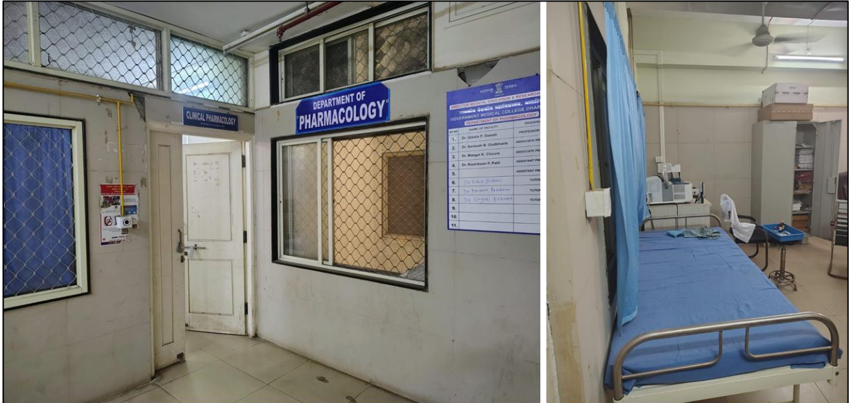
Clinical Pharmacology Room