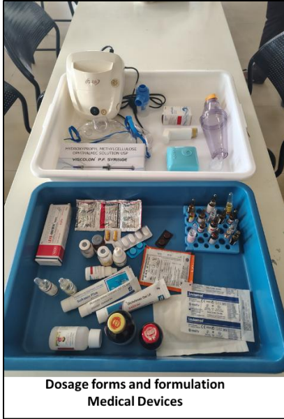
Dosage forms and formulation Medical Devices